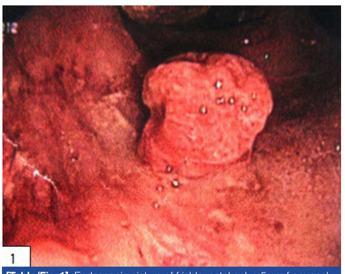
[Table/Fig-1]: Endoscopic picture of friable rectal polyp 5 cm from anal

A 14-year-old boy presented to the Gastroenterology Clinic with complaint of bleeding per rectum since the past 1 month. A colonoscopic examination revealed a friable rectal polyp (1cm), about 5 cm away from anal verge [Table/Fig-1]. On gross examination, multiple fragments of grey—white, small, soft tissue pieces were seen, largest pieces being 0.4 cm in maximum dimension. All materials were embedded for doing a histologic examination. On microscopic examination, sections showed a fragmented and a polypoid colonic mucosa which was ulcerated, with granulation tissue, oedema and a mixed inflammatory cell infitrate. Rest of the mucosa showed a focally reduced crypt density, mild muco-depletion and mixed inflammatory cells which were admixed with neutrophils and lymphocytes. One of the tissue fragments showed bony trabeculae in lamina propria, which were surrounded by osteoblastic cells